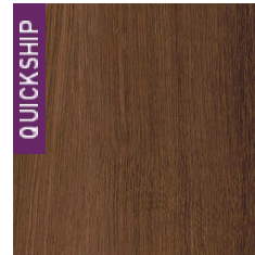
004 Autumn Leaf