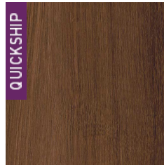
004 Autumn Leaf