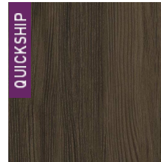
0830 Weathered ...