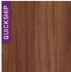
0780 Sugar Ma...