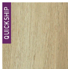
4006 Key Largo