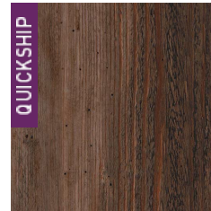
0820 Rustic Lo...