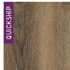
4007 Bay of Ple...