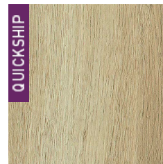
4006 Key Largo